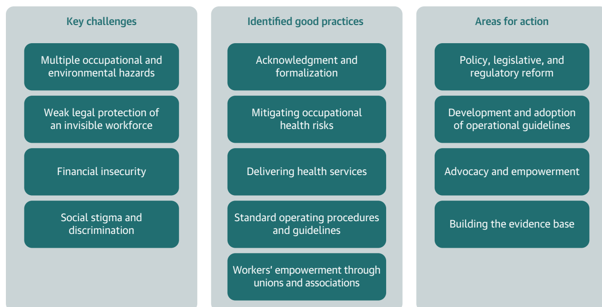
FIGURE ES.1. Key Challenges, Identified Good Practices, and Areas for Action

Sanitation workers range from permanent public or private employees with health benefits, pensions,